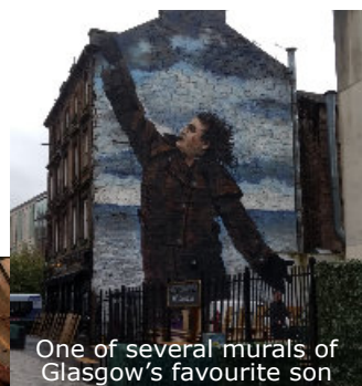
One of several murals of Glasgow's favourite son