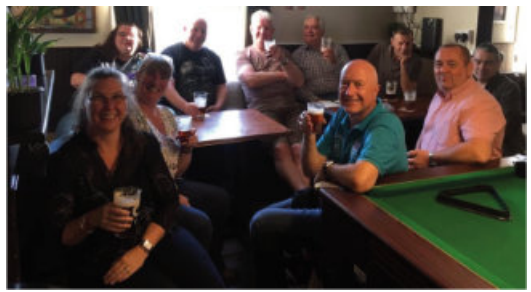
CAMRA members in the Half Moon

Now for the number crunching. The strongest drink of the day was Broadoak cider at 7.5% and the strongest ale was Thornbridge Jaipur at 5.9%. Not surprising, the most expensive pint was the cider at £3.80, while the most