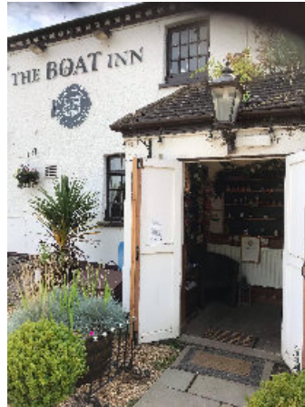
The Boat Inn, Stockton

much more substantial affair and a model that perhaps other villages could follow. In Kilsby - where the George is currently closed - the Red Lion has used space at the rear of its car park to rent out to a community owned village shop. In the 18 months since it opened it has become a hive of