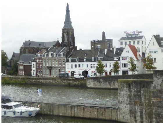
The old De Ridder brewery

Next day we decided to do some non-beer related tourism and headed to Valkenburg which is famous for having a hill, yep a hill, in a country as flat as the Netherlands that is a big