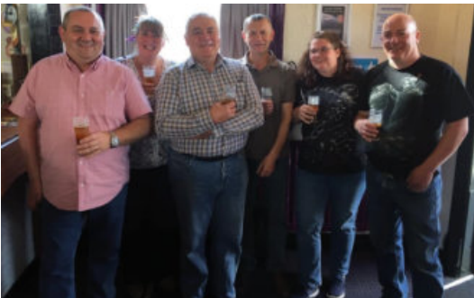
CAMRA members in the Wheeltapper

Back on track to the Prince of Wales which after 30+ years of single family